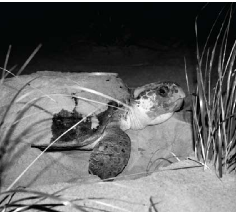
A nesting loggerhead covers up her nest before returning to the sea.

We would like to thank The Max and Victoria Dreyfus Foundation and The Streisand Foundation for their support of Oceana's efforts to protect sea turtles.