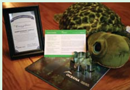
The "Casey" adoption kit is available in a limited edition of 200 at oceana.org/adopt .

In addition to her baking efforts, she has collaborated with North Carolina coffee brewery Joe Van Gogh to create an organic "sea turtle" blend. Her coffee is now carried in Whole Foods stores throughout the Carolinas, with 10 percent of the proceeds going to the sea turtle hospital.