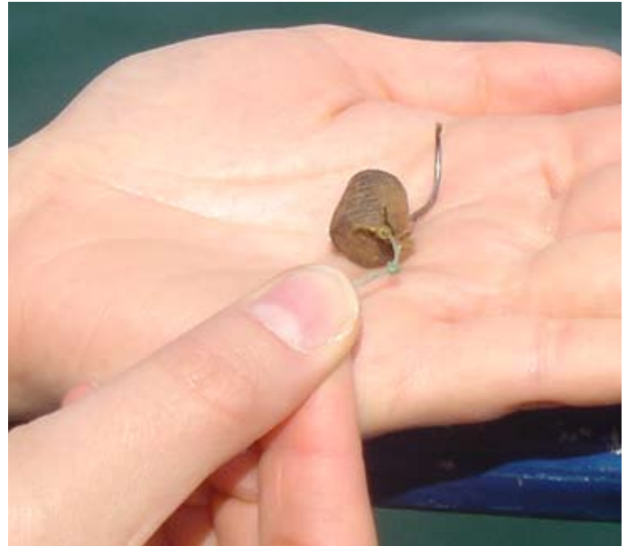
Pellets used to catch the species used for research purposes.

The analysis also found 87 parts per billion of Oxitetraciclina in a False jacopever, which did not contain any pellets used to feed salmons in its intestine.