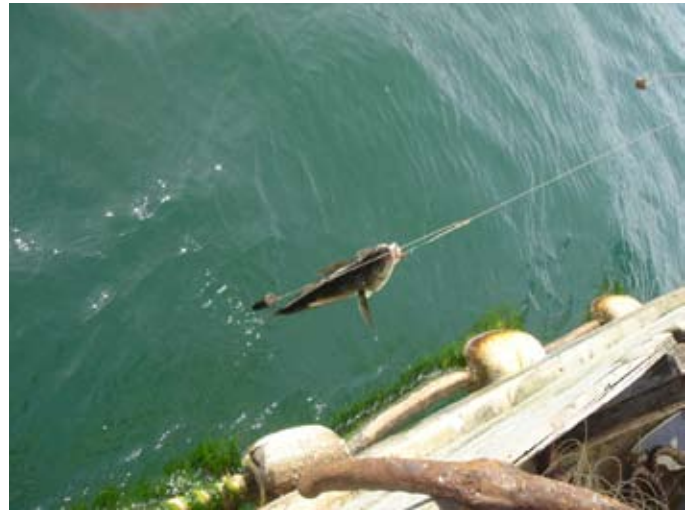
Fish caught during our research.

In Chile, as in other parts of the world, the fish farms and cages are surrounded by a wide range of marine ecosystems,