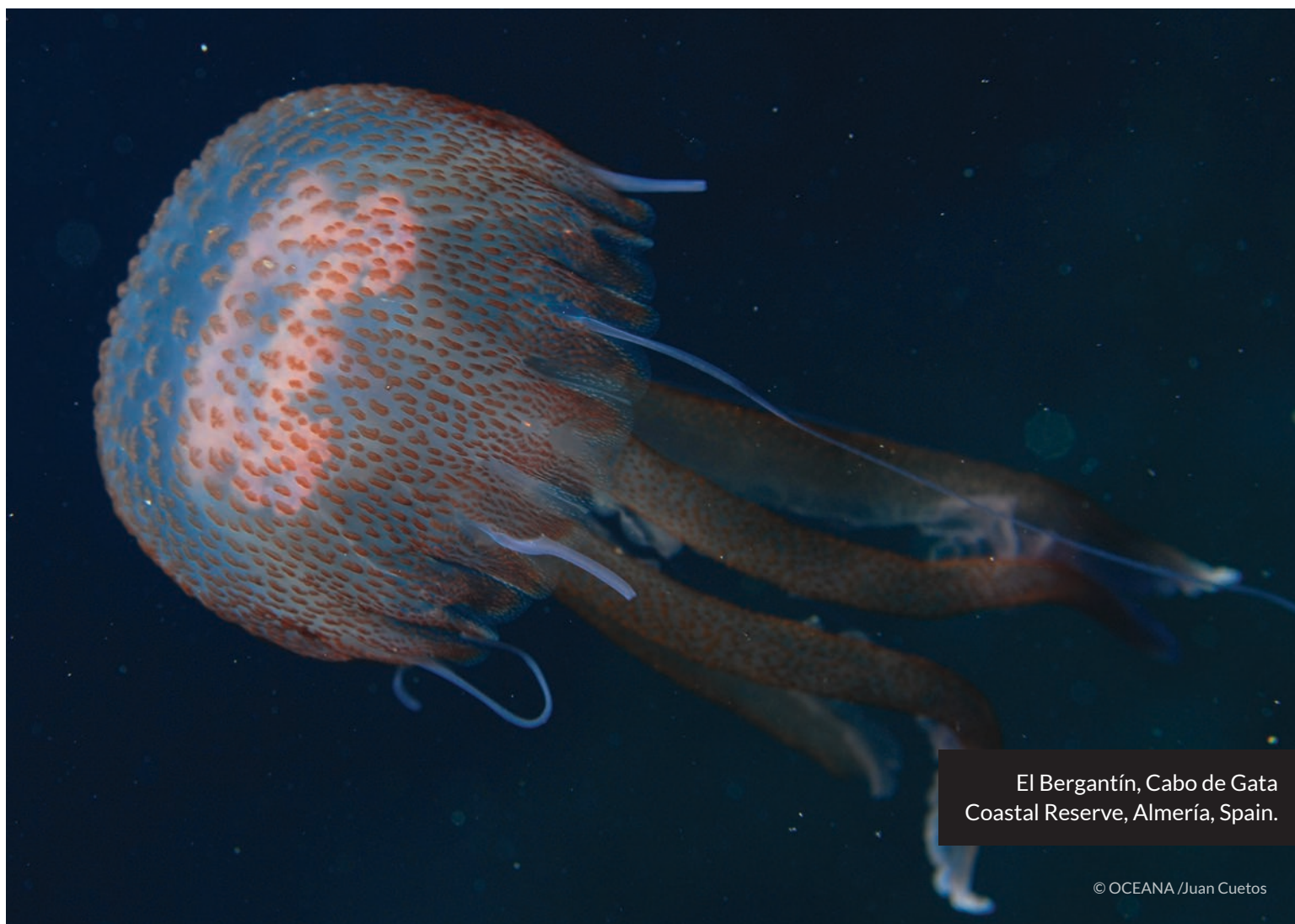
El Bergantín, Cabo de Gata Coastal Reserve, Almería, Spain.

Global | Washington, D.C. Europe | Brussels | Copenhagen | Madrid North America | Boston | Ft. Lauderdale | Juneau | Monterey | New York | Portland Central America | Belize City South America | Brazilia | Santiago | Lima Asia | Manila Canada | Toronto