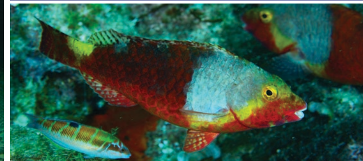
Page 6 (Clockwise): Videographer shooting in wall of shallow water; Striped dolphin jumping; ROV underwater; Sargassum; Waves breaking in the North Coast of Gozo, Malta. Page 7: Expedition leader Ricardo Aguilar explaining the campaign to Oceana ambassador Elsa Pataky and husband, actor Chris Hemsworth, onboard the Ranger ; Loggerhead turtle with a seriously injured back leg; Parrotfish and ornate wrasse; Diver in a cave.