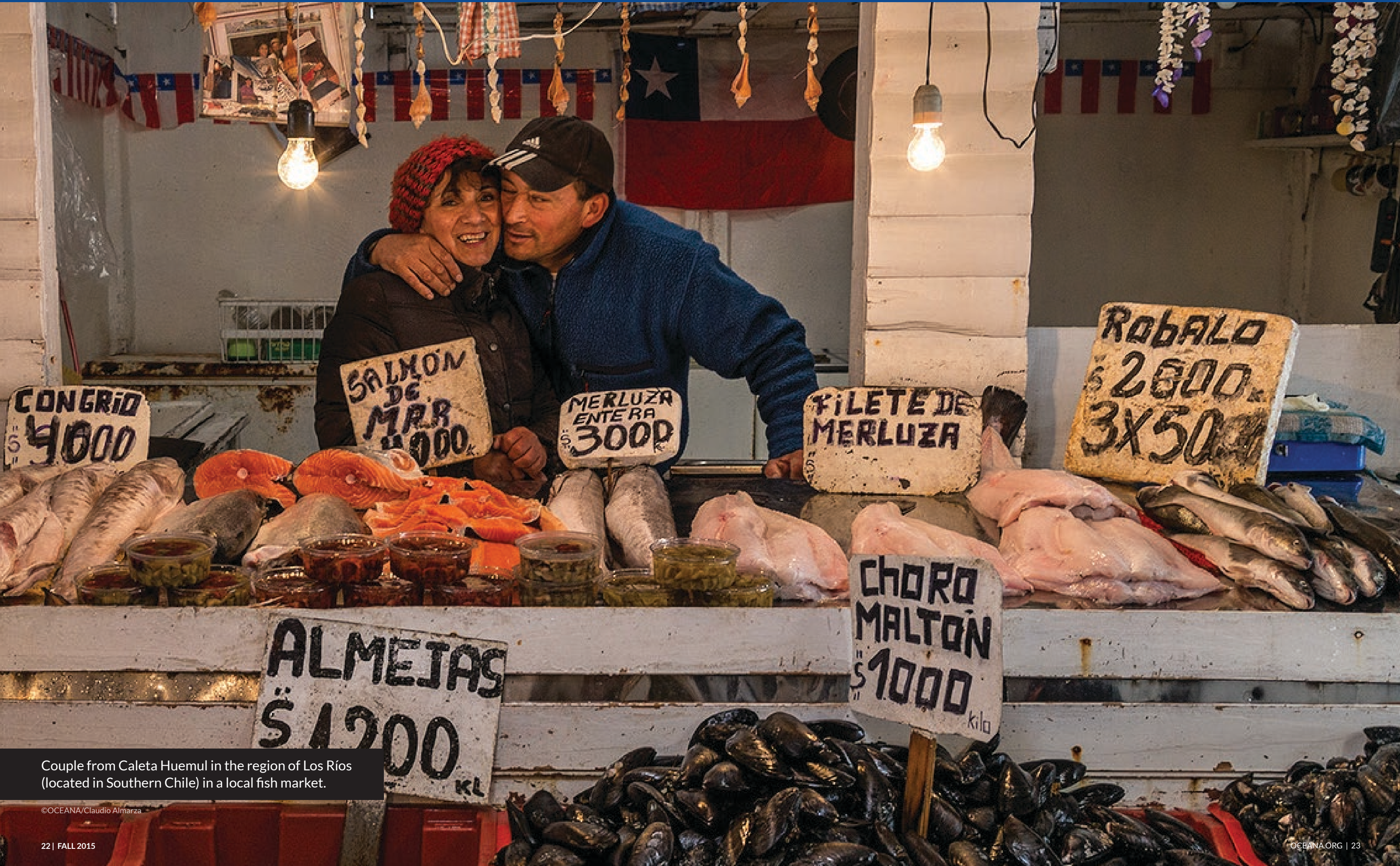
Couple from Caleta Huemul in the region of Los Ríos (located in Southern Chile) in a local fish market.