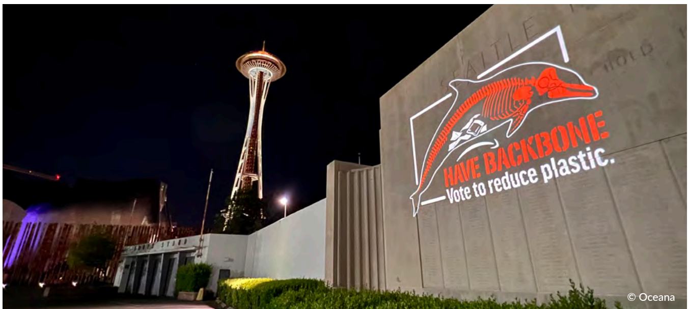
In May 2023, Oceana called on Amazon shareholders in Seattle, Washington, to vote for the company to support a plastic reduction proposal.

Despite consistently strong support for the resolutions, Amazon continues to ignore this effort by its shareholders, failing to meet their demands for the company to outline a plan for how it can achieve a one-third reduction in its use of plastic packaging by 2030.