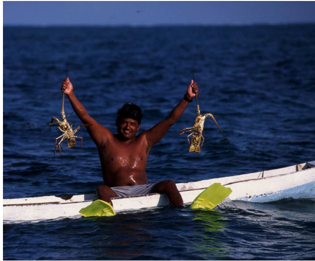
Lobster fisherman.