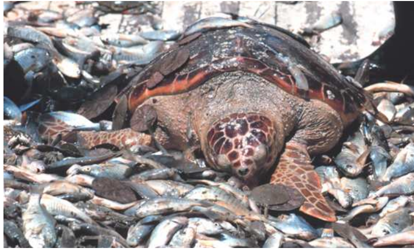
Sea turtle caught by destructive fishing gear.