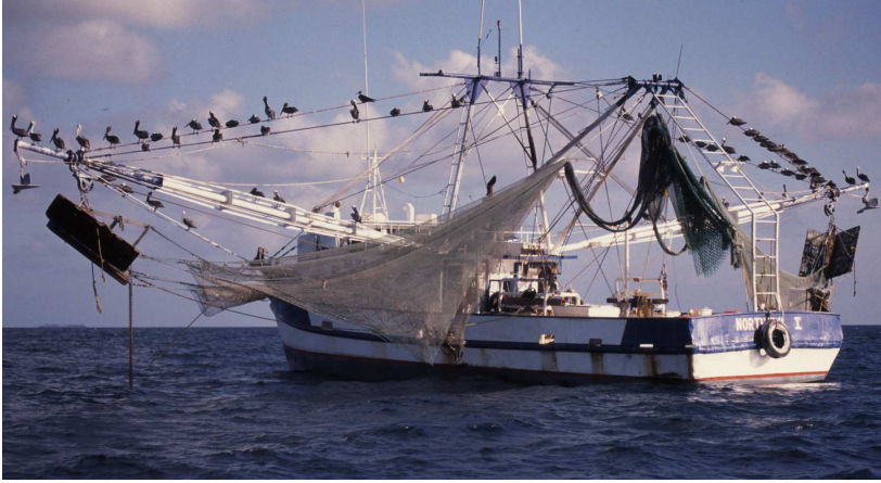
Belize bottom trawl. J.Stockbridge