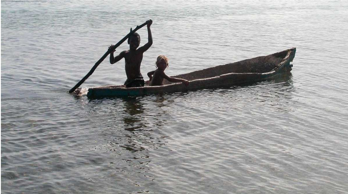
Children play in a fishing canoe.