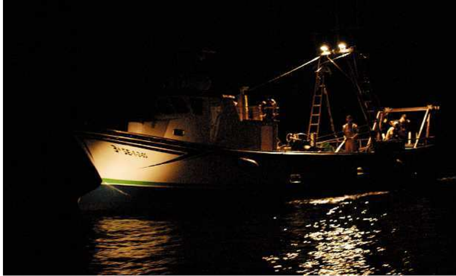
Spanish trawler fishing illegally at night.