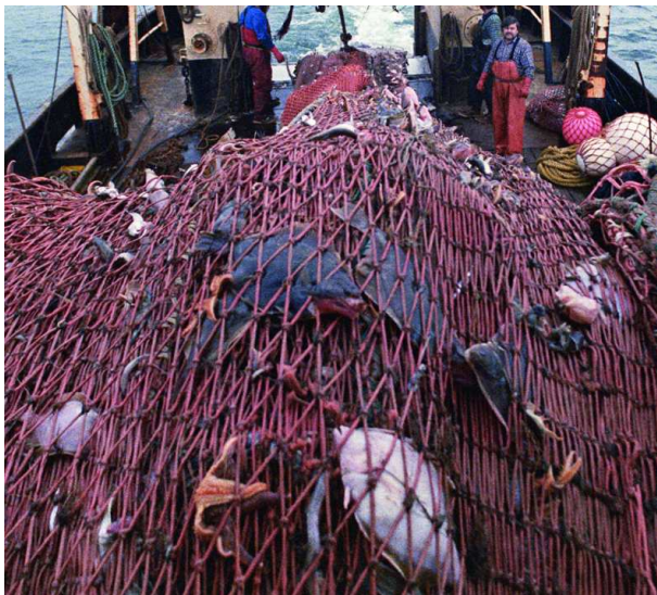
Unwanted fish caught in bottom trawl.

Bottom trawling is one of the most destructive ways to catch fish, and is responsible for up to half of all discarded fish and marine life worldwide (Kelleher 2005). Valuable fish, turtles, seabirds, marine mammals and other animals are all captured and discarded by bottom trawls, and many do not survive (Morgan & Chuenpagdee 2003). In a side-by-side comparison, bottom trawling for spot prawns threw away nine times as much bycatch as more selective fishing gear (Reilly et al. 2002).