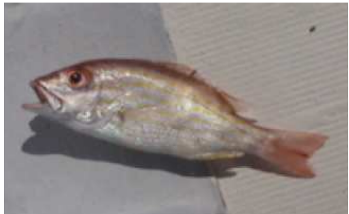
Young snapper discarded by trawler in Belize.

Bottom trawling often leads to overfishing because the gear is not selective and discards a lot of dead fish. Overfishing by bottom trawls is a direct threat to local fishing communities and to tourism from sport fishing.