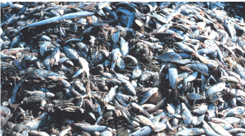
Dead fish discarded by a bottom trawler.

lobster and crab fishermen in the US. Industrial trawlers operated by foreign fleets drag through the gear of local fishermen in Guinea, destroying wooden canoes, other gear, and causing personal injuries (Lowrey 2004, EJF 2007, JALA).