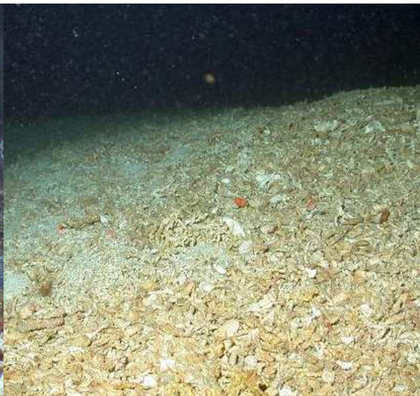
Florida's Oculina Banks.