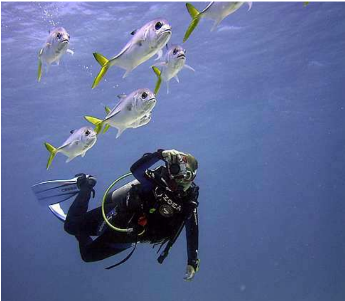
Diver with horse-eye jacks.

willing to pay more for a dive trip during which they are likely to see marine wildlife; including approximately $30 more to see a sea turtle, $35 to see a shark or $55 to see a healthy coral reef (Oceana 2008). Several endangered and threatened species in the US are in decline primarily because they are caught incidentally in destructive fishing gear, including the smalltooth sawfish.