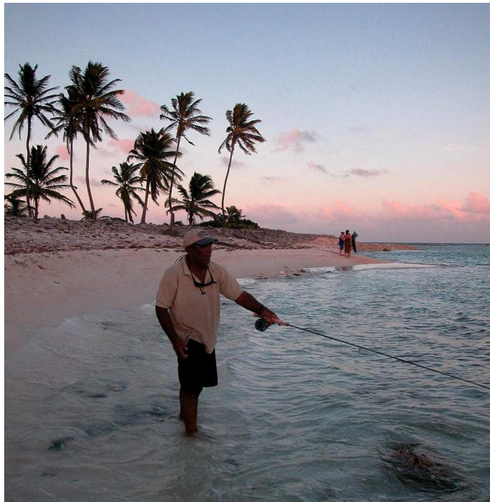
Fly fishing in the cayes.