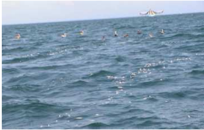
Fish dumped by trawlers in Belize attract pelicans. P.Lobel