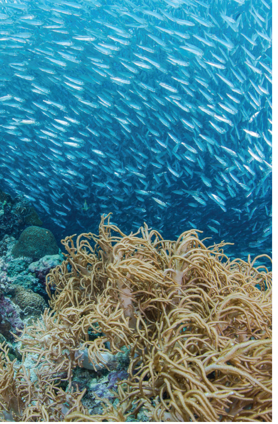
sharks. This annual migration happens roughly every July in the Philippines.